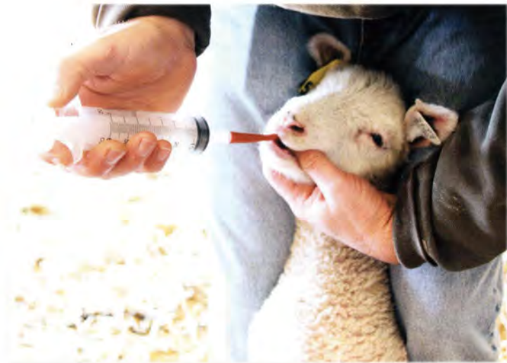
Figure 3. Administering colostrum via a stomach tube